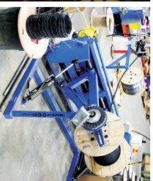
HVY DUTY RESPOOL